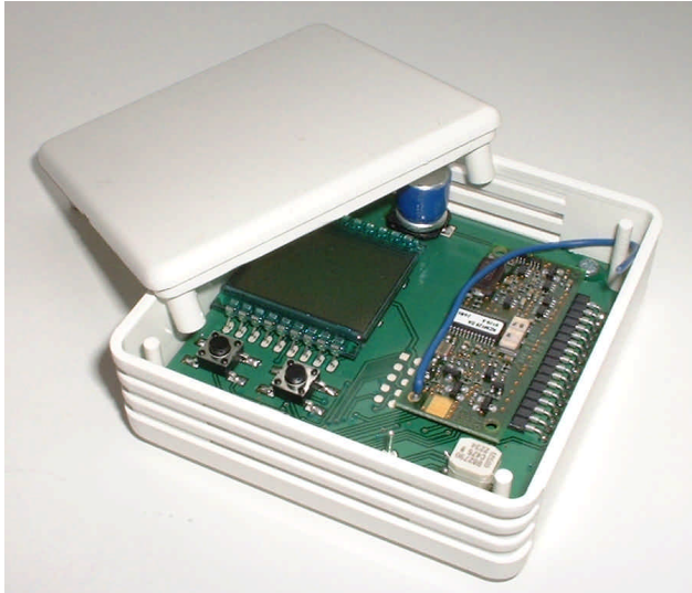
Figure 1: Gateway

SRC-KNX/ENO acts as a gateway between EnOcean radio sensors and the EIB/KNX bus. It has 32 channels, each of which can be configured with one of the following functions: